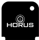
Battery Cap Opener