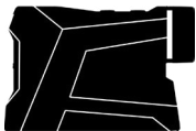
HoVR BT Laser Range Finder